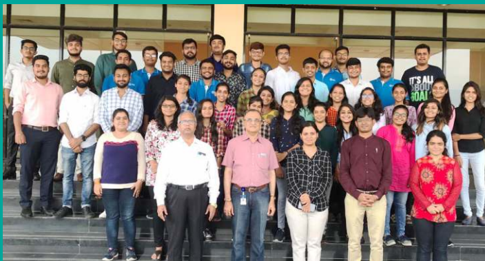
Memories with L & T Trainers and Teachers by Civil Dept. Gardians