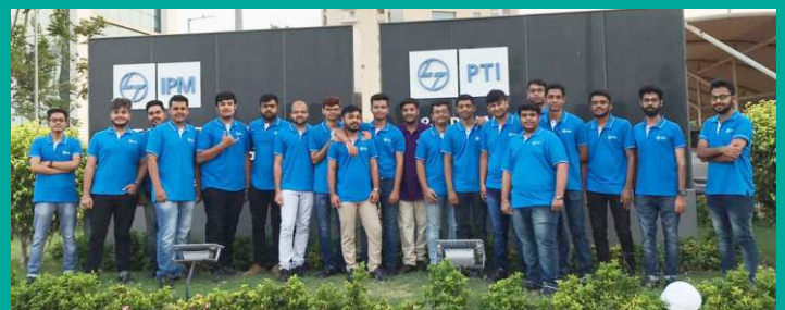
Interactive Learning in Professional Culture of L & T Institute

The department is happy with their progress and will encourage these stars to deliver the same to their juniors.